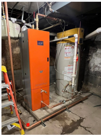
Installation in process